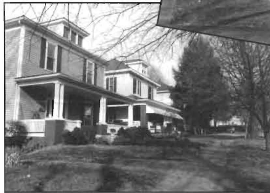
E. Jones Street, Oakwood H. D. (above); S. Boylan Avenue, Boylan Heights H. D. (below).

A copy of the revised COA list is available for the asking from the RHDC office. As always, if you are considering (con't. on p.3)