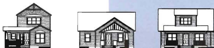
Raleigh Community Development Dept.'s new housing prototypes.