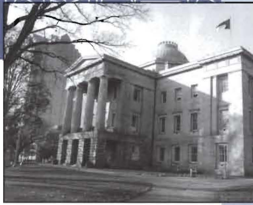
The 1840 State Capitol forms the heart of the historic district.

Established in 1976, Capitol Square is Raleigh's third locally-designated historic district. It encompasses not only the state's most historic government buildings, but also many of the city's oldest properties, some of which are individually listed on the National Register of Historic Places. Two properties—the 1840 State Capitol and 1854 Christ Episcopal Church—are designated as National Historic Landmarks. The area just east of Blount Street, along New Bern Avenue, includes a significant collection of late-18th century and 19th century residences; a series of historic church complexes fills much of the area west of the capitol.